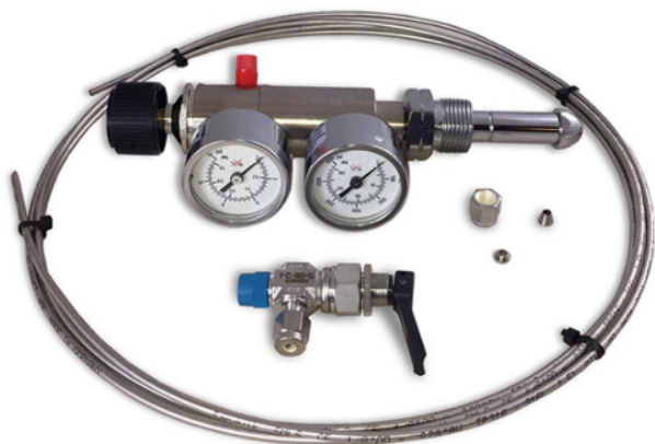
Figure 2a: Zero Air Dry-gas Kit (A0925)