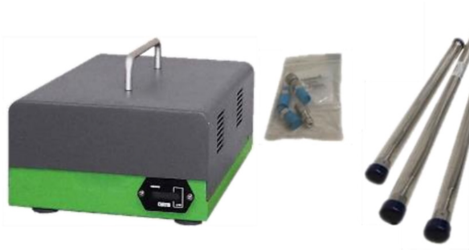
Figure 3: A0207 low leak diaphragm vacuum pump and vacuum tubing

When the G2201-i or G2508 Analyzer is purchased with the A0310 Recirculation Package it is delivered with the A0702 Low Leak Diaphragm Pump. This pump is specifically designed for recirculation with minimal leakage. Stainless steel tubing and fittings are included so that a closed-loop measurement system is optimized to provide a total volume of up to 100 mL for the analyzer, pump, and tubing.