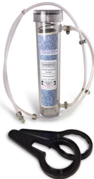
Figure 1: Drierite™ Desiccant Drier Kit (C0360)

A ZA dry-gas kit (A0923) and N 2 dry-gas kit (A0921) for Isotopic Water Analyzers are available for purchase from Picarro and include the recommended 2-stage regulator, tubing, and Swagelok™ fittings. ZA kit comes with a CGA-590 regulator while N 2 kit has a CGA-580 regulator.